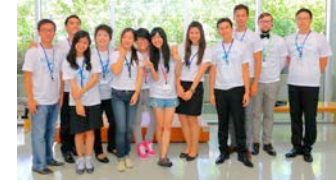
Class of 2014