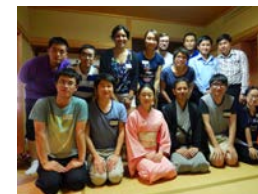
"Tea ceremony" experience