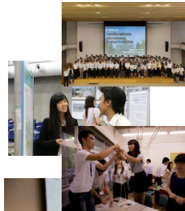
MISW (student workshop)