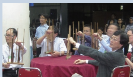
ITB AOTULE Banquet and cultural activity 2010