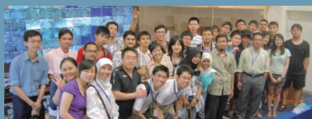
AOTULE student exchange field/factory tours in Japan, Malaysia and Indonesia.