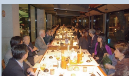
AOTULE banquet at National Taiwan University, 2009