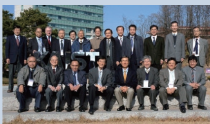
KAIST 2007 AOTULE Deans' meeting