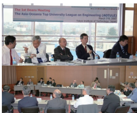
AOTULE's first Deans' meeting in 2007 at Tokyo Tech